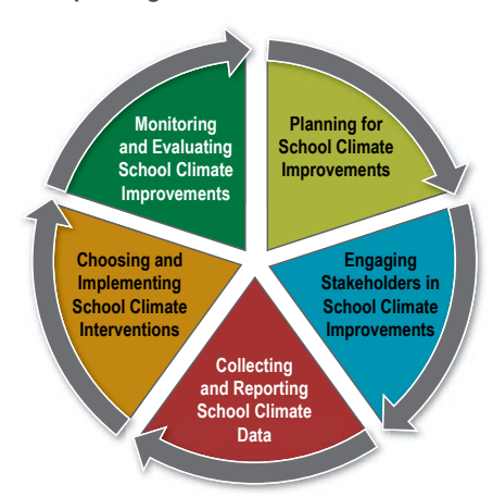
Figure 1. Five Activity Sets for Improving School Climate

and sustain school climate improvements. You can use the Quick Guide in combination with the other tools and resources available within the School Climate Improvement Resource Package (Resource Package), including self-assessments to identify which resources would be most helpful to you as well as pointers on how to approach school climate improvements.